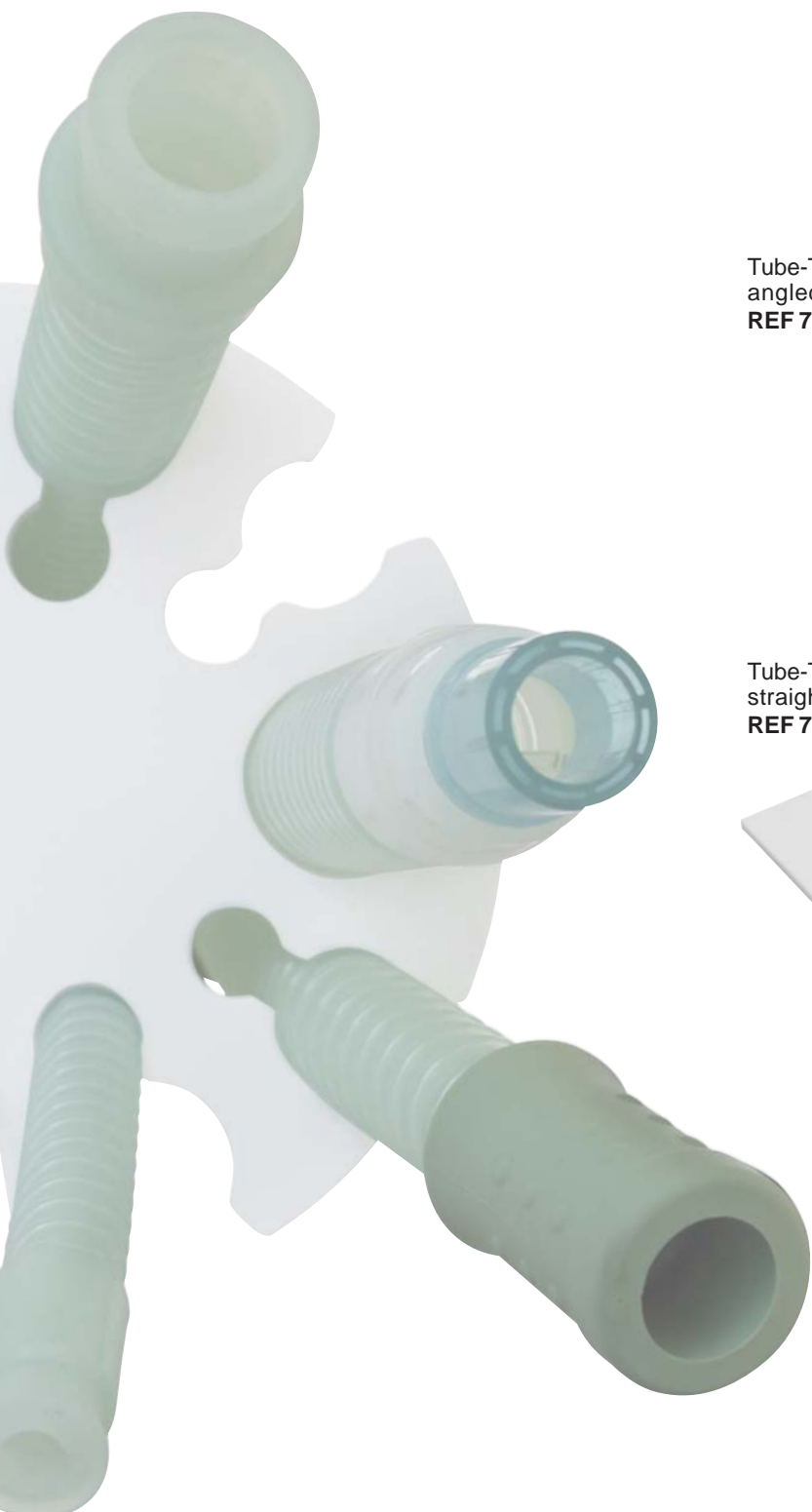
Tube-Tray, angled REF 77-20-000