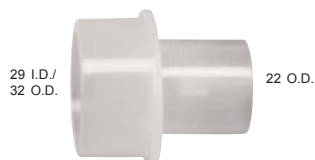
29 I.D./ 32 O.D.